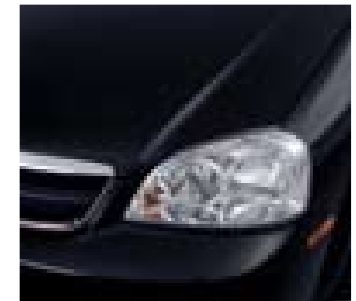
Fantasy Black Metallic

Grey Fabric is standard with all Forenza and Forenza Wagon exterior colors