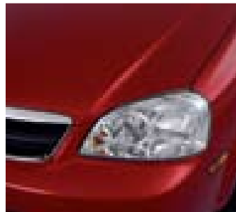
Fusion Red Metallic