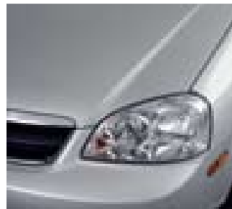
Titanium Silver Metallic